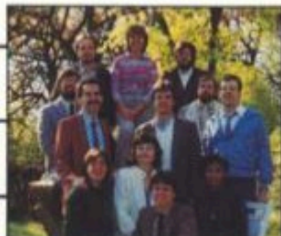
Action Graphics, adaptors for the Atari® 5200