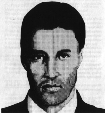
You play the part of Pinky Callahan.

Pinky is smart, good looking, very ambitious...a high roller. He hates the name "Pinky". Begins some contests with a reputation for toughness. Sometimes he is a wimp. He's mixed up with a fiery little hellcat named Lola. Not the kind of girl you want to take home to mother. Loves his Momma but she can't accept the life her boy has chosen to lead. Has a soft spot for his childhood friend, Tom Malone, who is now a cop. Pinky will lie, kill, and double-cross to get to the top. Plans to take control of Chicago by 1934. Figures he'll join the Syndicate to secure his empire.