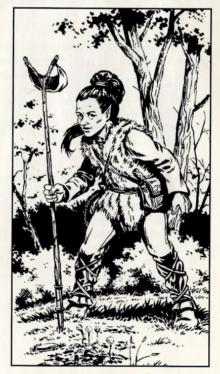
By Larry Elmore, from "Dragons of Mystery"

Leather armor: Hoopak +2 (damage 3-8); Sling +1 with a pouch of 20 bullets (damage 2-7).