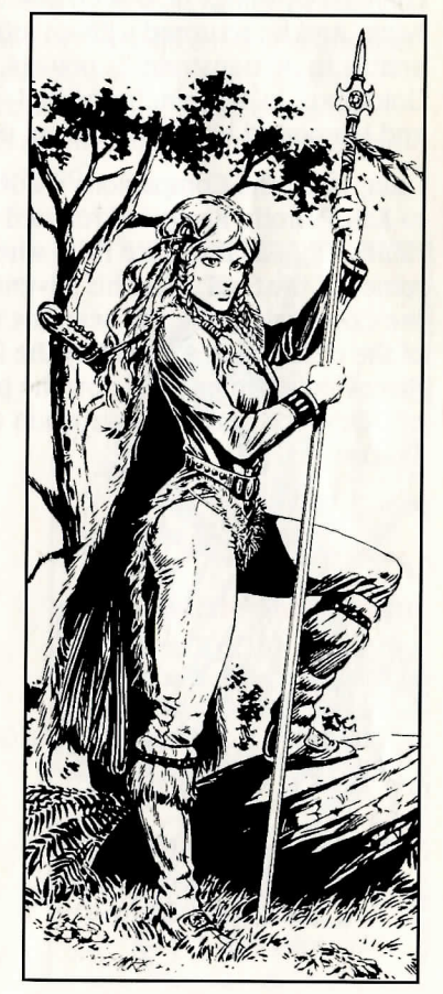
from "Dragons of Mystery"

Leather armor; Quarterstaff +2; Medallion of Faith; Clerical magic, see sub-menu.