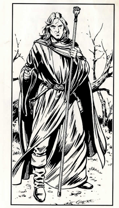
By Larry Elmore, from "Dragons of Mystery"

Staff of the Magius (+3 protection; +2 to hit - damage 1-8); Close combat with Staff as weapon; Ranged combat - see spell list.