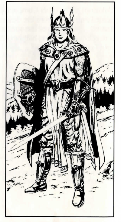
By Larry Elmore, from "Dragons of Mystery"

Ring mail armor; Longsword (damage 1-8); Spear (damage 1-6).