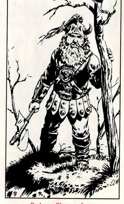
By Larry Elmore, from "Dragons of Mystery"

Studded Leather armor & Shield; Battleaxe +1 (damage 1-8); Throwing axes (damage 1-6).