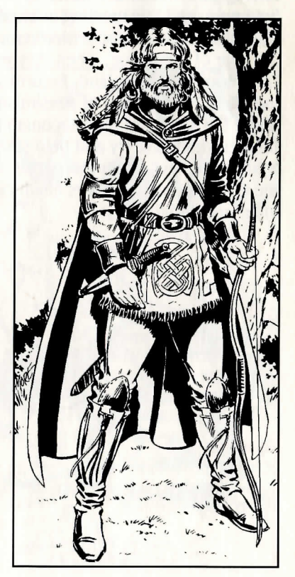
By Larry Elmore, from "Dragons of Mystery"

Leather armor +2; Longsword +2 (damage 1-8); Bow & quiver of 20 arrows (damage 1-6).