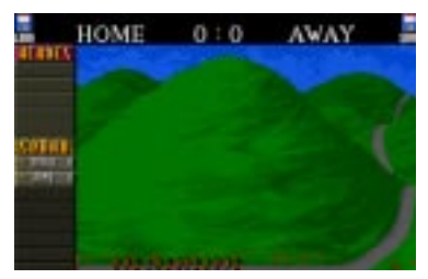
the map shows more than just an overview of the area

Select the map icon for an overview of the surrounding area.