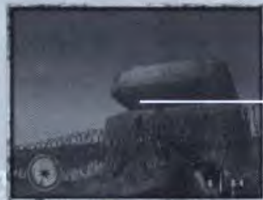
AIMING CROSS HAIR

Aim Mode lets you focus on getting a good shot on a slow-moving or stationary target. When you enter Aim Mode, you utilize the aiming sight or the scope of your current weapon and steady your aim, heart, and movements to hit the target.