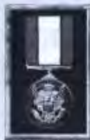
THE DISTINGUISHED SERVICE CROSS

The Distinguished Service Cross is awarded in recognition of extraordinary heroism in connection with military operations against an opposing Armed Force.