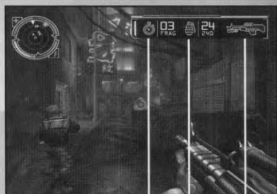
Primary Weapons Secondary Weapons Bio-augmentations

The inventory has three categories: Primary Weapons , Secondary Weapons and Bio-augmentations . All inventory items must be acquired.