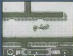
Lives Engery Meter Current Weapon

The energy meter displays Harry's health. When Harry takes hits, his energy suffers. If he is too badly injured, he will lose a life.