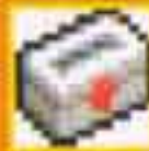
Disinfectant (for Karabons only)