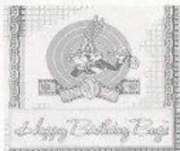
Carrot Symbol A Contraption

If you are caught by one of the contraptions, you will be stunned for a short time. While stunned, you cannot use the hammer. If you are caught twelve times, you will lose a life. The status of your current life is indicated by three hearts in the upper left corner of the screen. Each heart starts out red, turns white, then black and then clear when you are caught by one of the characters or contraptions.