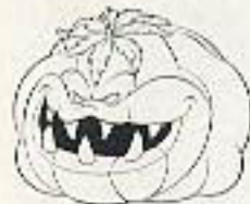
Tomacho - Bloated yet slow, defeat him to enter into the dark dank world of San Zucchini's sewers.

Most of the Gang of Six are to be avoided, as opposed to being stomped on by Chad. Learn their modes of attack in order to get past them, thereby defeating them!