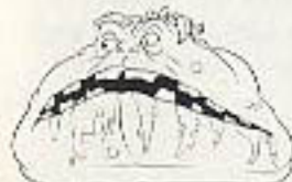
Ketchuk - This fat, gooey, monstrosity spews deadly spittle in your direction. He is to be avoided, not stomped on, for best results.