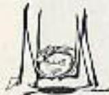
Tomato Spiders - Quick-footed monsters.