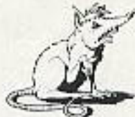
Tomato Rats - Swim the sewers looking for fresh meat.