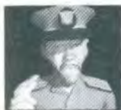
ADMIRAL TURNER DELANEY

The ability of a Commander determines the difficulty of a mission. (e.g., Kennedy may have an excess of shore batteries you must contend with, where Delaney has none.)