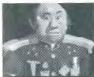
VICE ADMIRAL BALLAST

The easiest of your opponents, Delaney's best days are behind him. However, do not underestimate this high-seas veteran.