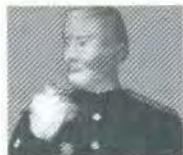
ADMIRAL LEONID VASILIEV

Second only to Vasiliev in skill, Schreck is utterly cunning —never turn your back.