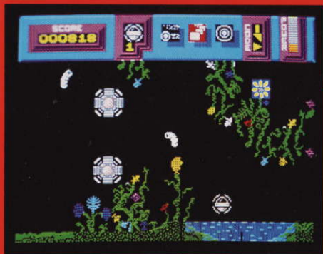
Yellow Phosphors Energising Water Pool