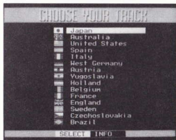
Fig. 3 Screenshot from PC version

You are presented with the Circuit Standings screen (fig. 3), which lists the names of all the tracks, the name of the winner at each stop on the Circuit, and the Circuit's cumulative point standings. In addition, the next track in the Circuit is highlighted.