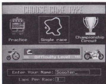
Fig. 1 Screenshot from PC version

Setting up a race is easy as shaking a magnum of victory champagne. Use the joystick (or keyboard equivalents) to move the highlighter around the Choose Game Type screen (fig. 1). After you've made all of the following selections (1-4), press Enter to proceed to the next set-up screen.