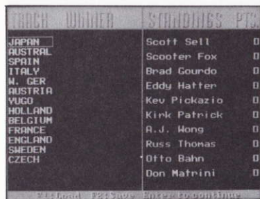
Fig. 2 Screenshot from PC version

You are presented with a list of the 8 international tracks in the Grand Prix Circuit (fig. 2). These include Japan, Australia, the United States, Spain, Italy, France, England and Sweden.