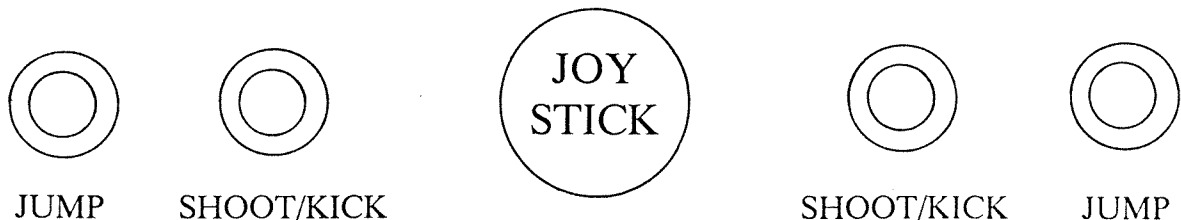
FIGURE 1 - Suggested Control Panel Layout

Install the Control Panel Overlay by peeling off the paper backing and carefully laying the overlay down on the panel. Smooth it out starting in the center and working your way out to the edges, removing all of the trapped air pockets. If possible, cut the edges of the overlay oversize and fold the excess under the panel. Cut out the button and joy stick holes. Install the BUTTON ID labels supplied with the kit.