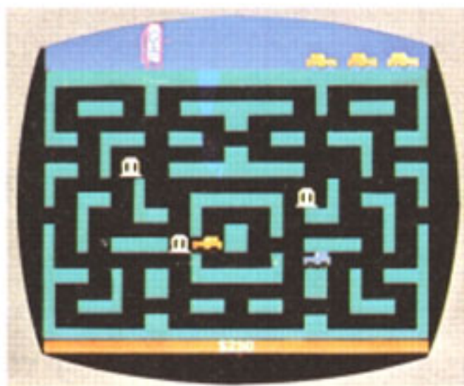
SILVER DOLLAR, SOUTH DAKOTA

The bar on the right side of the gas tank shows the level to which your tank can be refilled WHEN YOU LEAVE TOWN. If the pointer is white, the amount of gas in the tank will be refilled to the height of the bar. If the pointer is red, the gas level in the tank will remain the same. Robbing nine or more banks in a town will enable you to refill the entire tank.