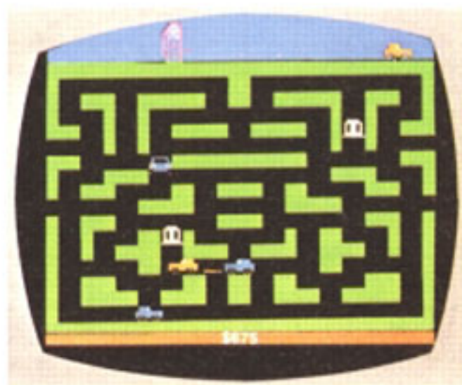
FLAT BROKE, ARKANSAS