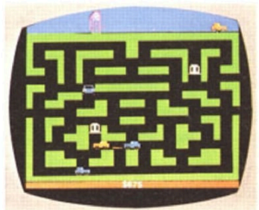
FLAT BROKE, ARKANSAS