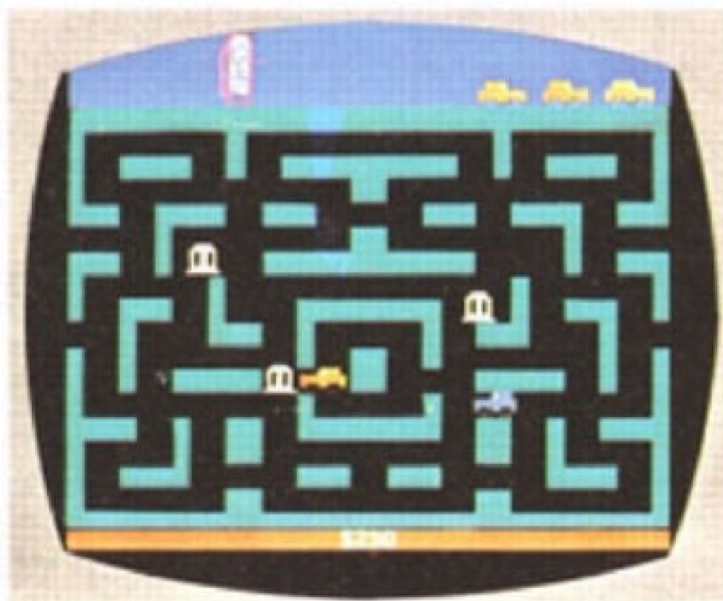
SILVER DOLLAR, SOUTH DAKOTA

The bar on the right side of the gas tank shows the level to which your tank can be refilled WHEN YOU LEAVE TOWN. If the pointer is white, the amount of gas in the tank will be refilled to the height of the bar. If the pointer is red, the gas level in the tank will remain the same. Robbing nine or more banks in a town will enable you to refill the entire tank.