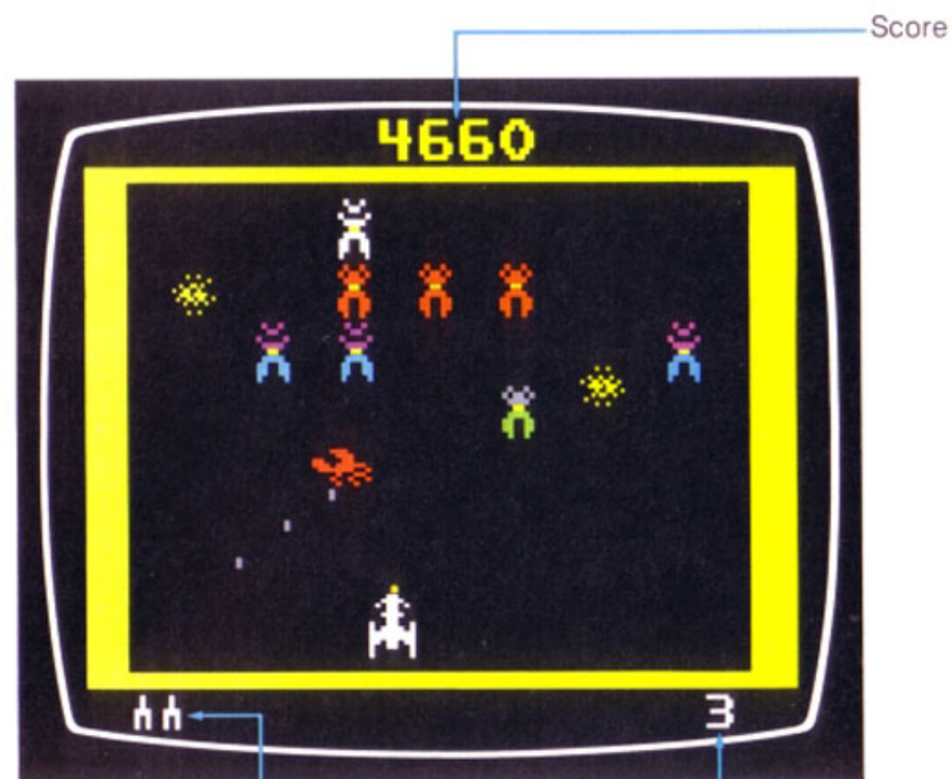
Laser Bases Remaining