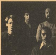
Sydney Software, adapters for Colecovision®