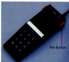
Figure 4 - 5200 Controller

Press the right # key (or, on your overlay, the square marked GAME SELECT) to cycle through EASY PLAY, STANDARD PLAY, and HARD PLAY. Stop at the variation you want to play. (See Figure 6 .)