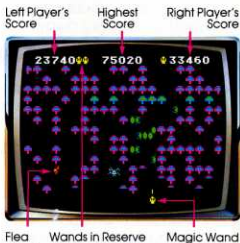
Figure 2 - Two-Player Game