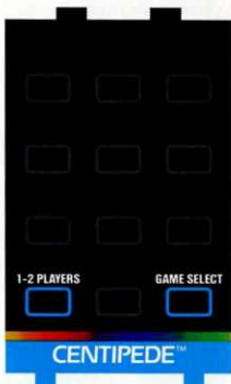
Figure 5 - Keypad Overlay