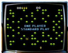
Figure 6 - Player and Game Select Display (Menu)

Move your joystick in the same direction you want to move your magic wand. You can move a