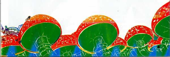
Figure 3 - Centipede Attack Formations, Waves 1-3