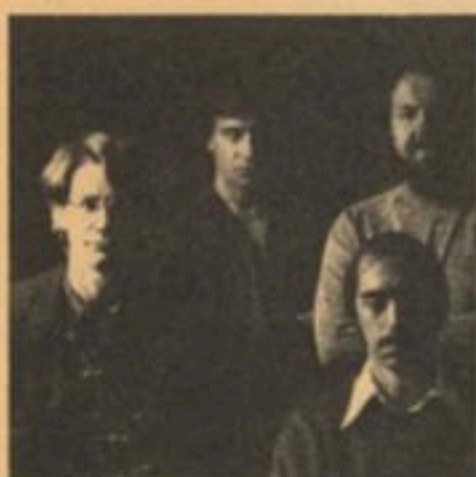
Sydney Software, adapters for Colecovision®