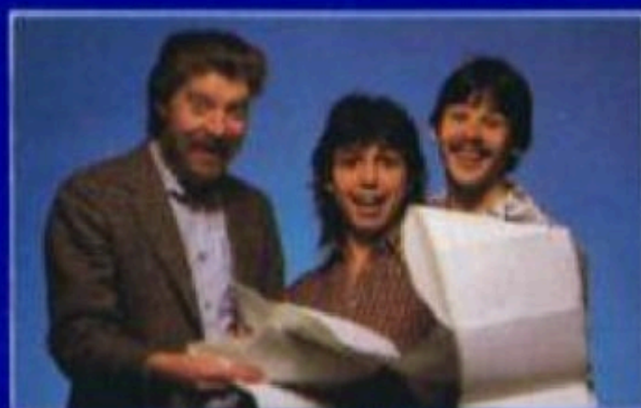
Adapted by Beck-Tech.