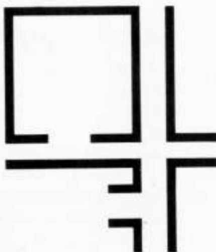
Figure 1. Sample Display

The DUNJONMASTER both draws a map of a portion of the dungeon and displays your status, including the number of the room you are currently in, your physical condition, and how much weight you are currently carrying. Part of the display is reserved for reporting messages that are of immediate importance to you (see Figure 1). There are a number of possible messages, and more than one of these may appear at the same time. These messages are self-explanatory during play, but a few are included in Figure 1 as an example. The circled numbers in the figure correspond to the descriptions under the sample display.