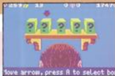
Move arrow, press R to select box

In the Guess room, an arrow appears on one of the five cans. Push a button to shuffle the cans. If Louie selects the can with the arrow in it, he receives a valuable prize.