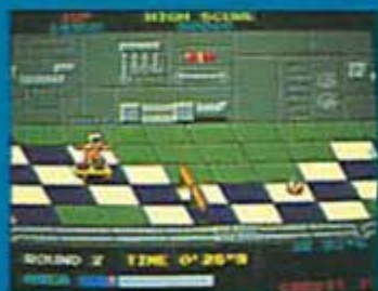
Screenshots are from original Arcade game.