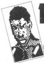
FRANK BRUNO GREAT BRITAIN