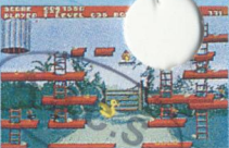
Screen shots from Amiga version