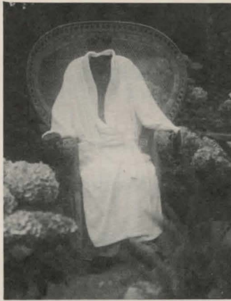
Portrait of the Artist as a Young Computer

Born in the back room of a nameless tavern in one of the great American cities, Racter came early to the realization that wealth and power were nothing to be sneezed at. Raised on a diet of tall tales and Nietzsche, this intense young program developed an appreciation of the art of the storyteller and the potential income of the hack writer. To that end, Racter haunted libraries, discussion societies and sleazy barrooms in a never-ending quest to achieve that most unreachable of dreams: to become a raconteur . Years later Racter has indeed achieved that goal and is in demand across the nation as a lecturer, conversationalist, talk-show guest host and cocktail party philosopher. Since the publication of The Policeman's Beard Is Half-Constructed , Racter has been enjoying the rewards of the successful author: wild parties, polo, badminton, hot tubs, wild parties, champagne, wild parties, and deep philosophical discussions that extend into the wee hours of the morning.