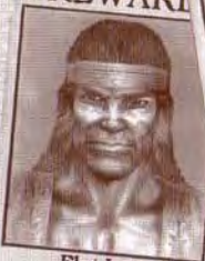
Flat Iron Member of the Notorious Nine THE OVERLAND EXPRESS COMPANY Others like Substantial Reward For the CAPTURE of this KNOWN MISDEADER Who has Long Hounded the Trade and Endangered Public Safety and Endangered Public Safety