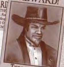
Tennessee Vic LEADER OF THE NINE WANTED across the Territory and Beyond for Murder, Kidnapping, Train Robbery, and a Host of Unnumbered Crimes TRUE IDENTITY UNKNOWN Bounty will be paid DEAD OR ALIVE SHERIFF TERRYSON