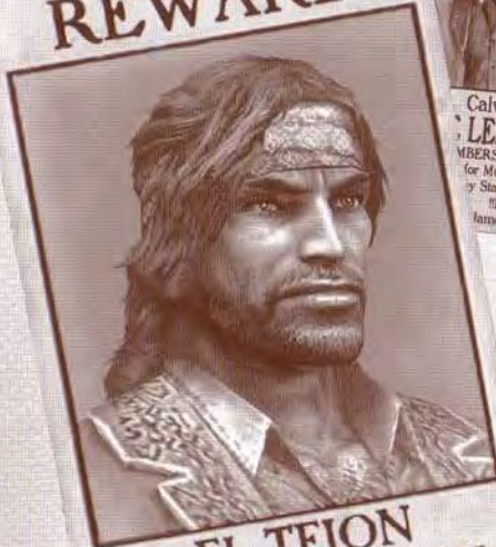
EL TEJON WANTED DEAD OR ALIVE for MURDER and T... and LAWLESS INVOLVEMENT NOTORIOUS NINE CONTACT SHERIFF WACO COUNTY B. COKEY COUNTY STATE OF T...