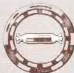
Power added to your Power Meter at the mission's start