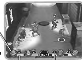
Energy Gauge Score

This shows the amount of power at your disposal. Power is required to execute signature moves or throw Shuriken. When this meter is full, you can execute a Special Move.