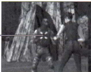
Team Targeting Icon

Dispatching tough foes sometimes requires a group effort.