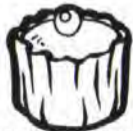
SHUMAI (Steamed Dumpling)