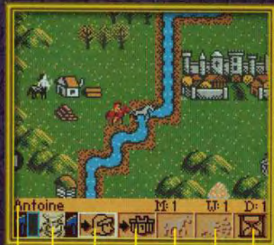
HERO NAME HERO PICTURE NEXT HERO NEXT TOWN MOVE HERO CAST SPELL END TURN

Press SELECT again to return to the game.