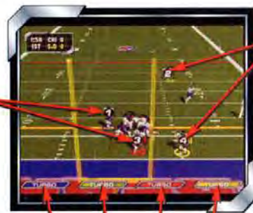
Players 1 & 3

PLAYER CONTROL: NFL Blitz 2000 allows you play with up to four players. If you are playing a four player game, the teams are split into two players per team. On Offense or Defense, two players can put their skills together to punish their opposition. On Offense, one of the players is the Quarterback, while the other player is set as a Receiver without any specific play pattern to follow. On Defense, you can have one player rush the QB or just hang back with the other player to ensure no progress is made by the Offense. Each player will have an icon above them with their player number to show their location on the field. Each player's TURBO METER is located on the bottom of the screen.