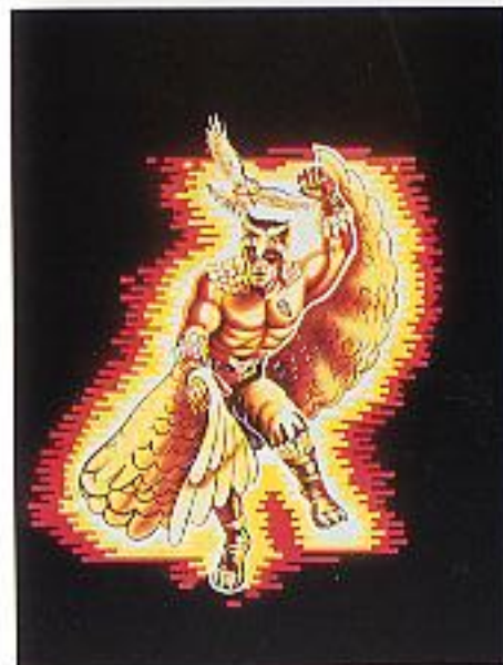
Level 1-2: Raptor™