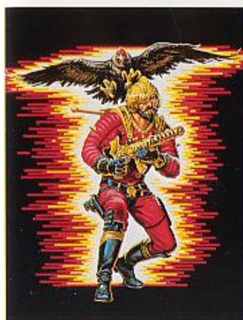
Level 4-3: Voltar™