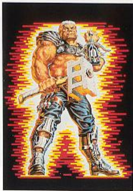
Level 4-2: Road Pig™