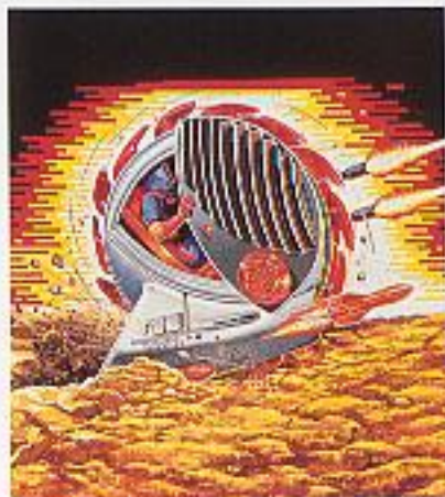
Level 2-2: Buzzboar™