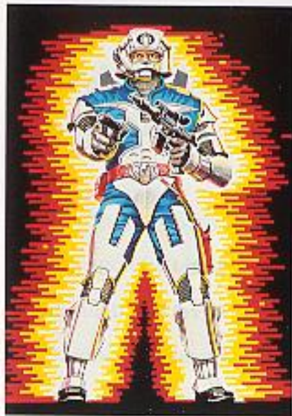
Level 6-1: Cobra Commander™