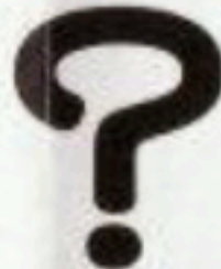
KING QUILLER 5000pts