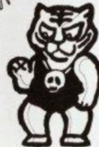
BOSS AREA 5