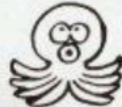
RED OCT (100pts)