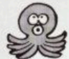
BLUE OCT (200pts)