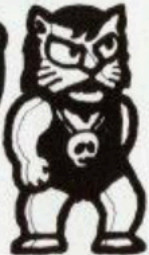
BOSS AREA 8

There are brown Kello and green Kello. Be careful as brown Kello jumps.