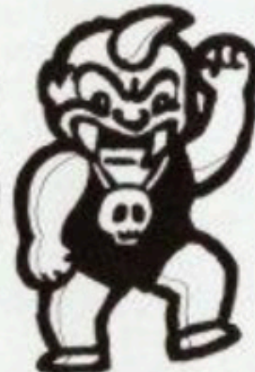
BOSS AREA 6