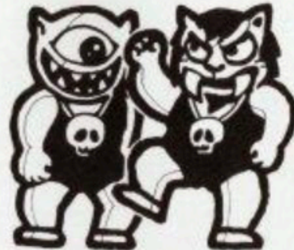
BOSS AREA 3