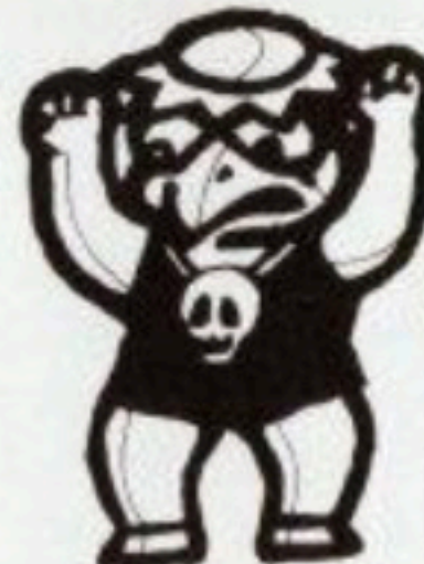
BOSS AREA 7