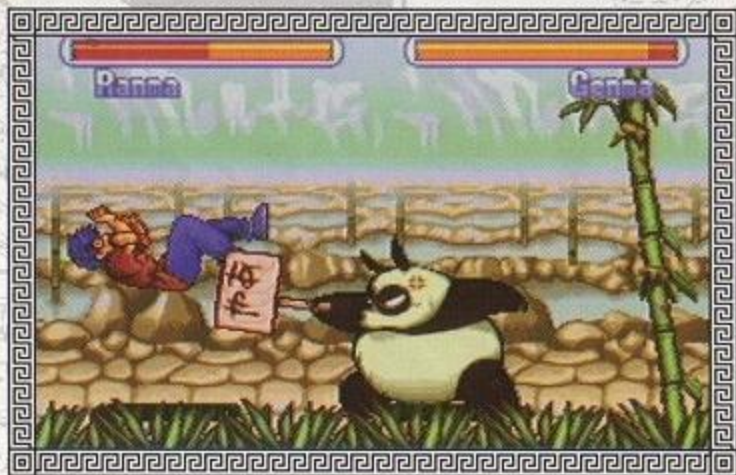
GENMA - SIGNBOARD PUNCH

Having a rebellious son like Ranma has been a big headache and heartache for Genma Saotome. After hearing the principal's pep talk, Genma resolved to achieve his ultimate strength by any means available. In this way he could demonstrate his paternal dignity to the world. Even if it means transforming into a Panda!