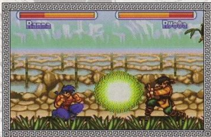
RYOGA - LION'S ROAR BULLET

Ryoga, the wanderer, accidentally lost his memory. He was taken in by the principal's slick talk and fooled into fighting faces from his past - even Akane, his heart-throb! What a loser!