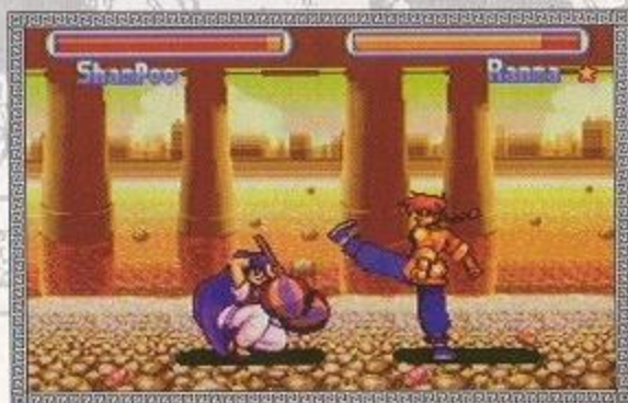
RANMA-CHAN - BASIC KICK