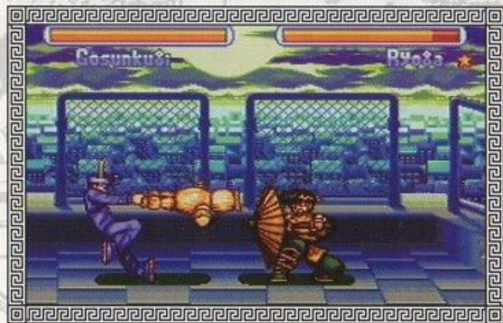
HIKARU - GIANT SPINNING STRAW MAN

When it comes to gloom and doom, Hikaru Gosunkugi is number one on the list at Furinkan High School. With a push from the principal, he's ready for his own personal pursuit, completely armed with candles tightly secured to his head. Now, he's full of dark power!