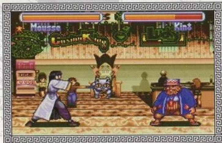
MOUSSE - PONCING CAT