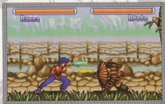
RANMA - SWEET CHESTNUT FIST

Thinking that he would be excused from school exams if he could beat the fighters chosen by the principal, Ranma firmly resolved to devote his time to martial arts training, rather than to the pursuit of academic discipline.