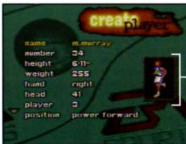
Picture of player

Control Pad \leftrightarrow to change highlighted option