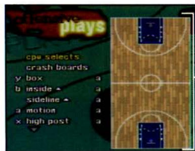
Animated play diagram

Seven offensive sets are available in NBA Live 98 , and each set contains from 4–10 plays.