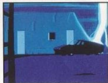
Lightning hits the laboratory

Plug in the game pak and turn on your Super Nintendo Entertainment System. After the Out of this World logo vanishes you may press any button to get to the Start / Continue screen. You may choose either Start or Continue by pressing up or down on the control pad. Select 'Start' and press 'B' to start the game. Once the game has started, push up on the control pad to swim to the surface of the water.